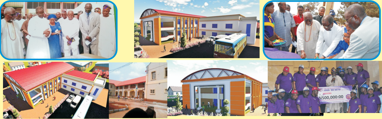
Thanksgiving @ Holy Trinity Anglican Church