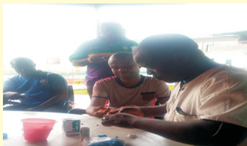
Our medical check up session