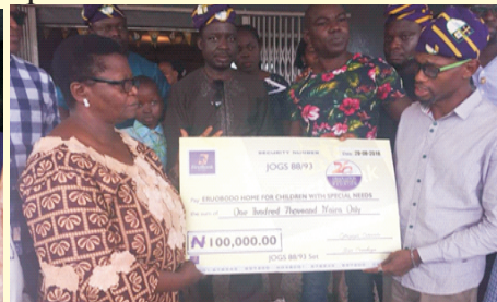
Our visit to Eruobodo Home for children with special needs.