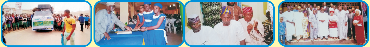
Prayer for the School @ Ijebu-Ode, Central Mosque