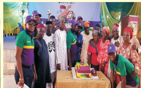
Appreciating our teachers.