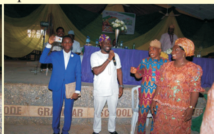
The set President announcing the Scholarship award for the best graduating student.