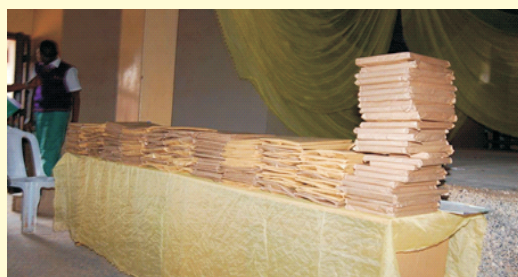
In readiness for the Prize giving ceremony.

The anniversary was wrapped up on the 2 nd of September with a thanksgiving service in the Holy Trinity Anglican Church domiciled in the school. Find below pictures from the event.